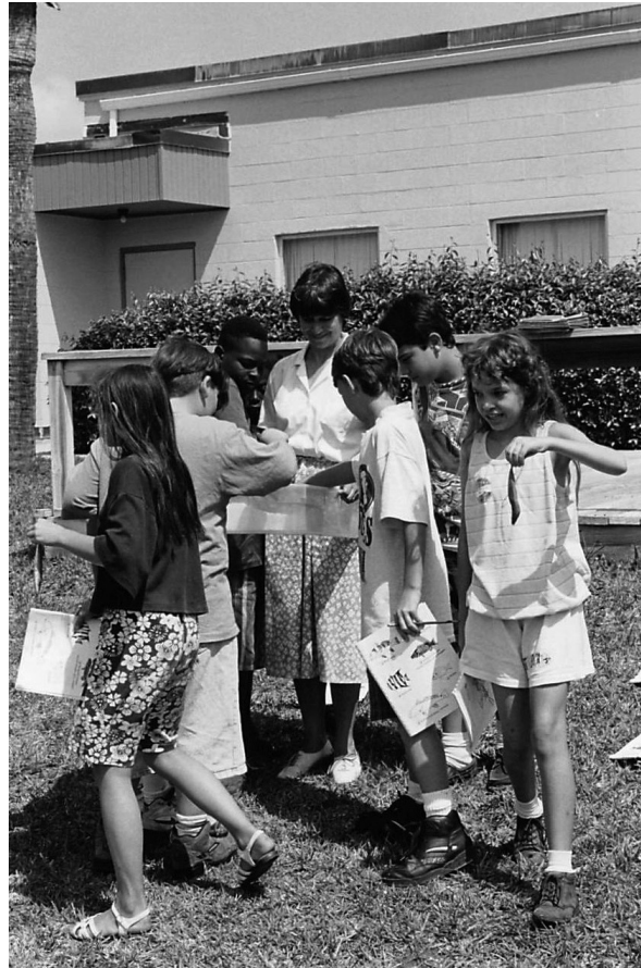
A Day at the Whitney Lab has been offered for 30 years.

These students are just a sampling of the thousands who have participated in the Day at the Whitney Lab over the last 30 years. This program, created by faculty and volunteers at University of Florida's Whitney Laboratory for Marine Bioscience, is designed to help children experience what it's like being a scientist. And, after the difficulties of the global pandemic that forced the lab to close for a time, its