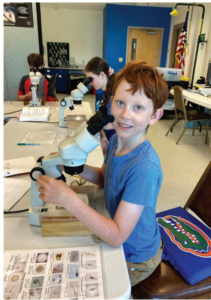
A student uses a microscope during a Day at the Whitney Lab.

This can sometimes be overlooked in the effort to teach mandated curricula and prepare students for standardized tests. But research shows that most Nobel Prize winners developed an interest in science at a young age and outside of standard classroom activities. Whitney Laboratory is taking that message to heart with its hands-on, question-and-observation-based